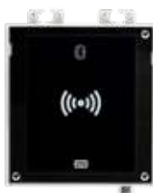
2N® ACCESS UNIT 2.0 BLUETOOTH & RFID ord. 9160335 9160335-S (secured)