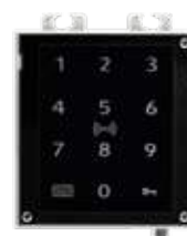
2N® ACCESS UNIT 2.0 TOUCH KEYPAD & RFID ord. 9160336 9160336-S (secured)