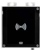
2N® ACCESS UNIT 2.0 RFID ord. 9160334 9160334-S (secured)