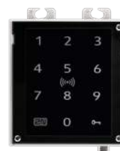
2N® ACCESS UNIT 2.0 TOUCH KEYPAD & RFID ord. 9160336 9160336-S (secured)