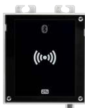
2N® ACCESS UNIT 2.0 BLUETOOTH & RFID ord. 9160335 9160335-S (secured)