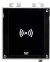
2N® ACCESS UNIT 2.0 RFID ord. 9160334 9160334-S (secured)