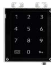
2N® ACCESS UNIT TOUCH KEYPAD