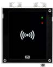
2N® ACCESS UNIT RFID

ord. 916009 (125kHz) ord. 916010 (13.56MHz)