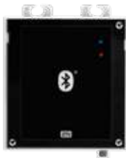
2N® ACCESS UNIT BLUETOOTH

ord. 916009 (125kHz) ord. 916010 (13.56MHz)