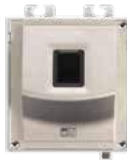
2N® ACCESS UNIT FINGERPRINT READER