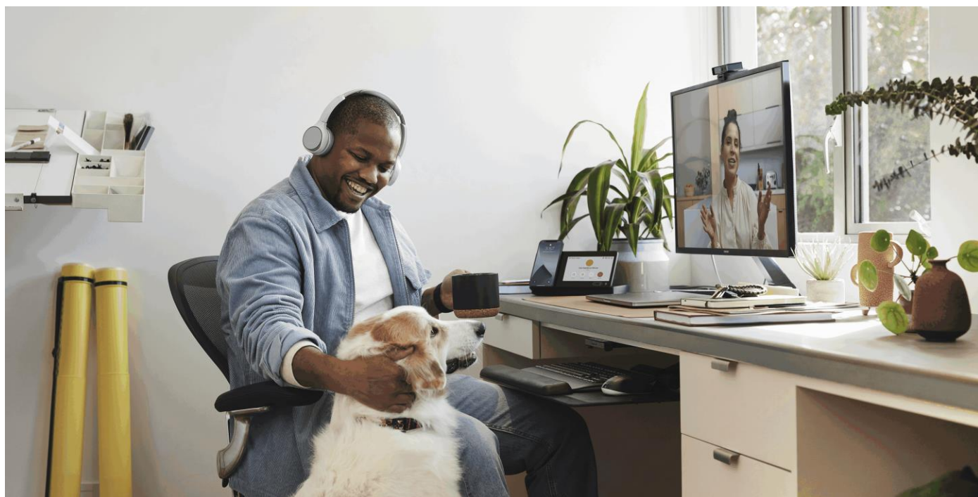
Above: Employee working from home using a Cisco Headset 730 and Webex Desk Camera

The Cisco® Headset 730 is a premium Bluetooth® headset built for business, personal, and the journey between.