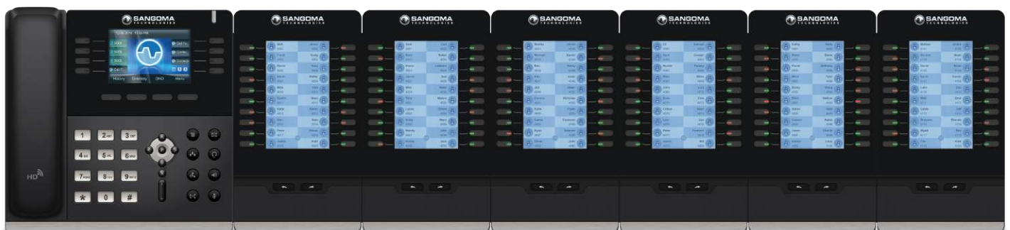
Daisy-chain Up to 6 Modules

The EXP100 is managed and provisioned by the Sangoma s500 and s700 IP Phones which means they can be auto-provisioned efficiently via Zero Touch Provisioning and the FreePBX / PBXact UC EndPoint Manager.