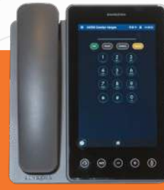
Executive Model P370