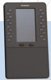
Expansion Module PM200