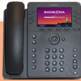
Mid-Range Models P320, P325, P330