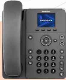
Value Models P310 & P315